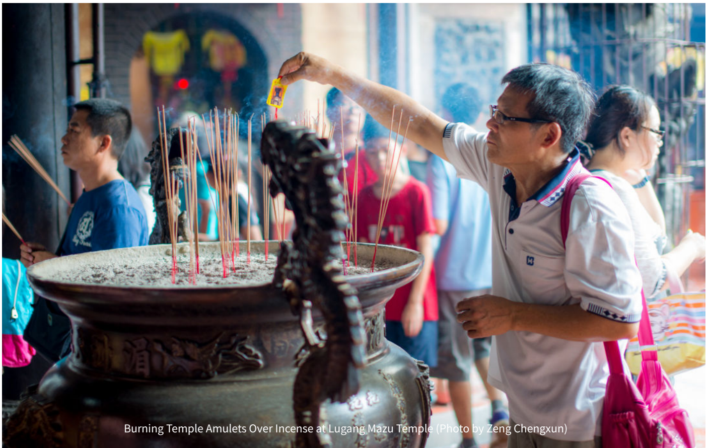
Burning Temple Amulets Over Incense at Lugang Mazu Temple

The Mazu faith does not have a permanent clergy. Temple affairs are often led by management committees or boards of directors, which are composed of representatives elected by local believers. These committees oversee temple operations, festivals and maintenance, ensuring that the organizational direction