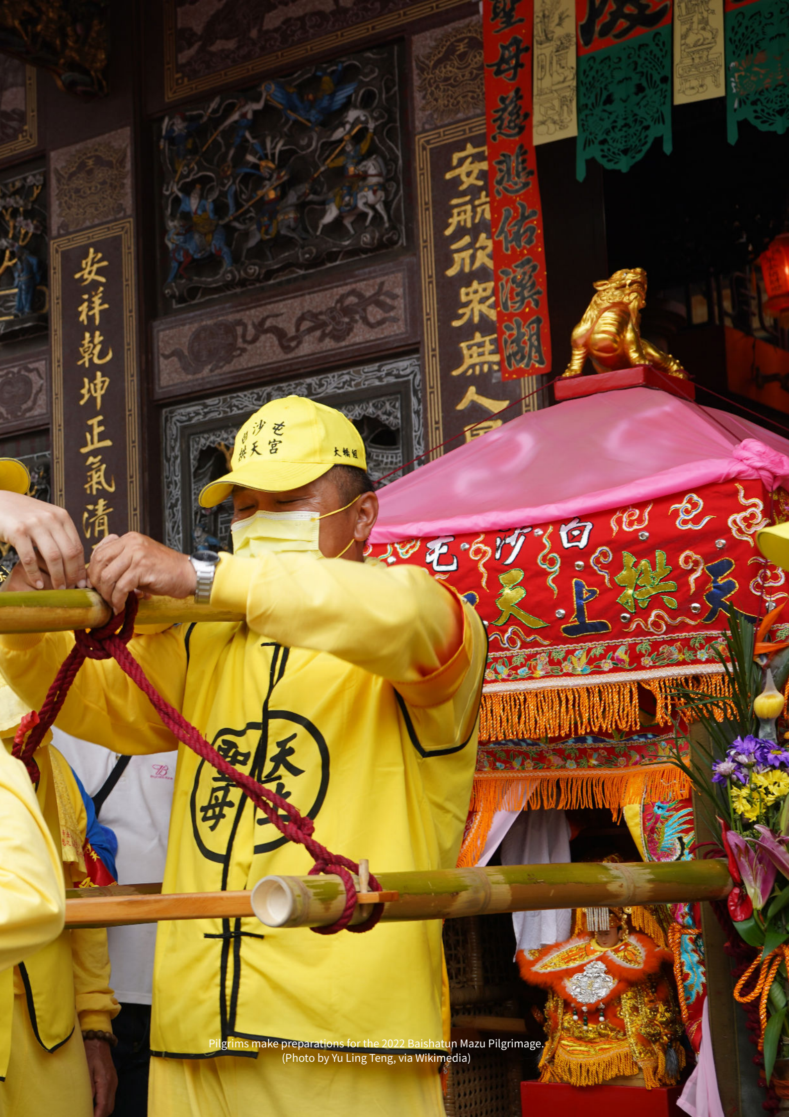
Pilgrims make preparations for the 2022 Baishatun Mazu Pilgrimage.