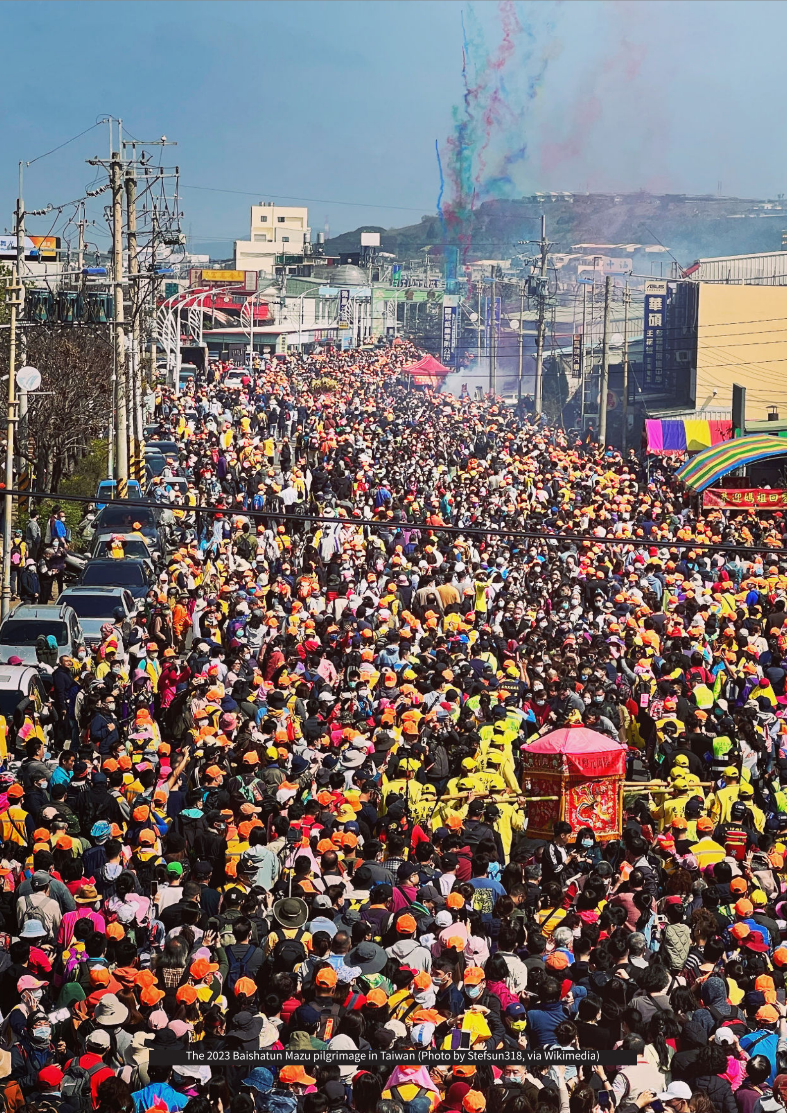
The 2023 Baishatun Mazu pilgrimage in Taiwan