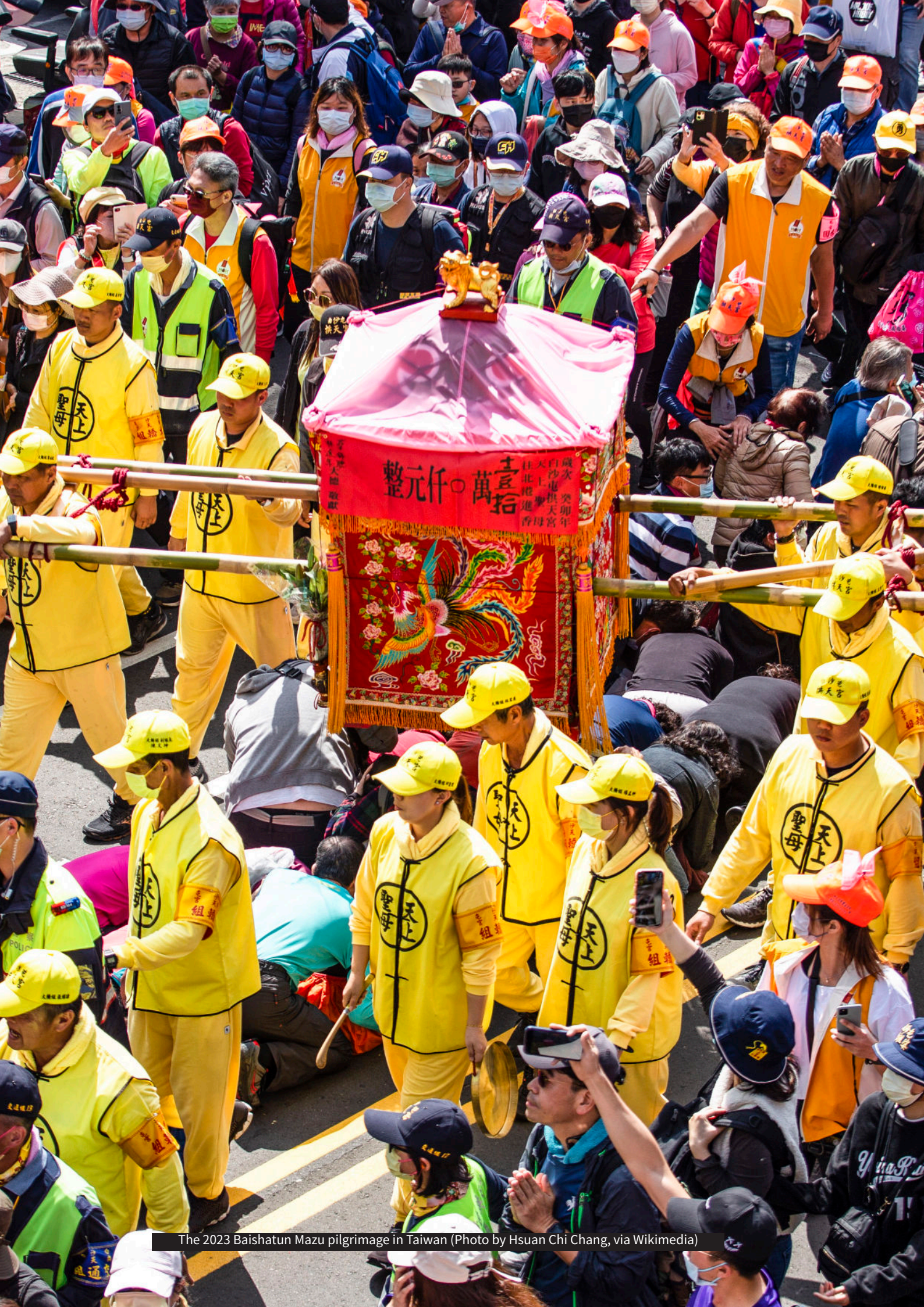
The 2023 Baishatun Mazu pilgrimage in Taiwan