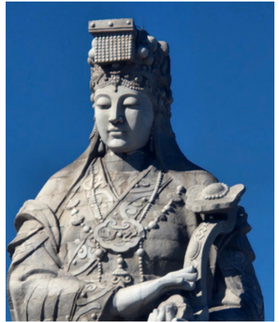
Binhai Mazu Cultural Park, Binhai, China, 2024.

Mazu is today Taiwan’s most widespread folk deity, with scholars estimating that around 61% of Taiwan’s population, or roughly 14 million people, identify as her followers. 2 A vast network of over 3,000 temples dedicated to Mazu can be found across the island, ranging from small, locally managed shrines to grand institutions like the Meizhou Mazu Temple in