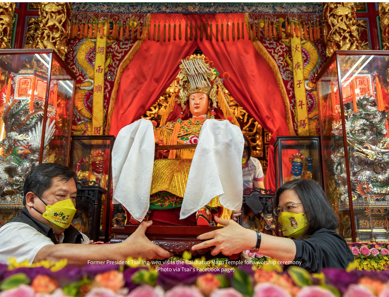
Former President Tsai Ing-wen visits the Baishatun Mazu Temple for a worship ceremony (Photo via Tsai's Facebook page)