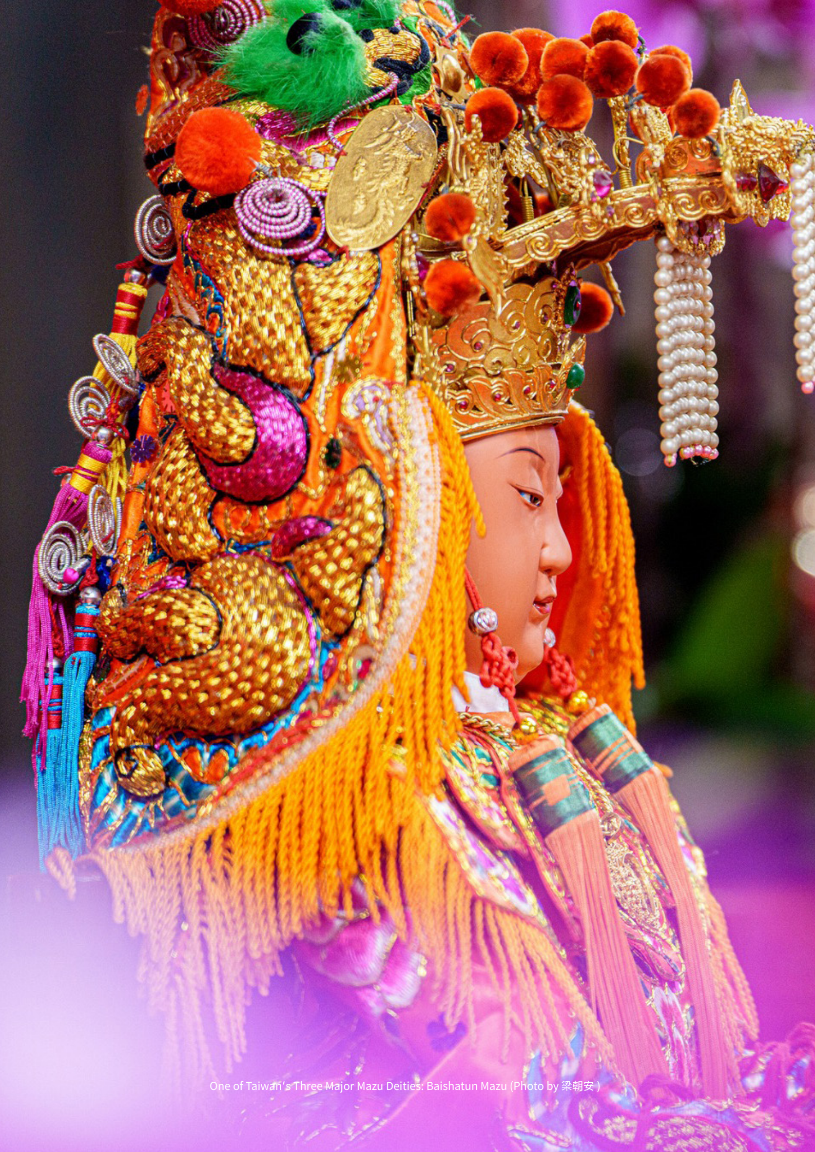
One of Taiwan's Three Major Mazu Deities: Baishatun Mazu