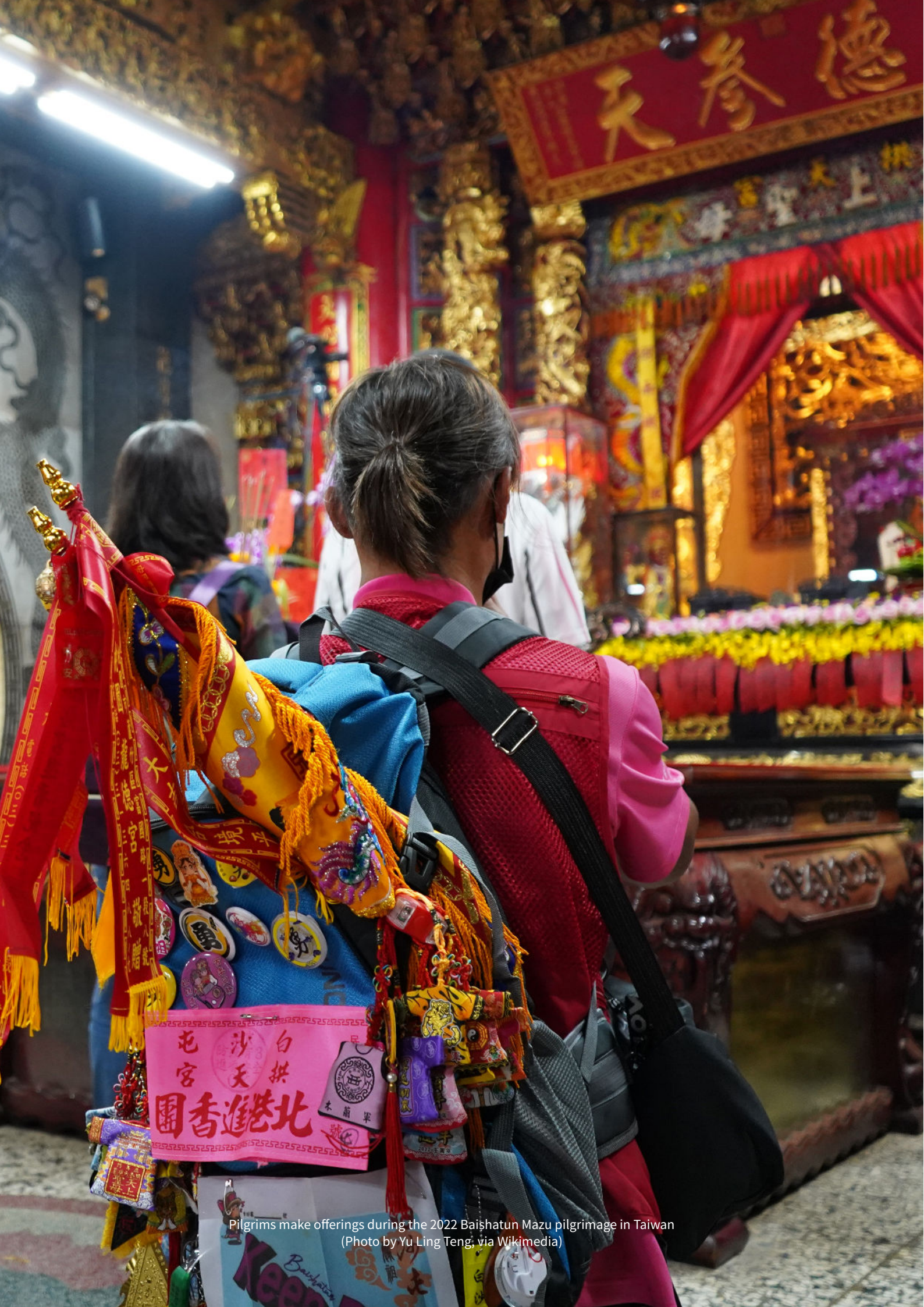
Pilgrims make offerings during the 2022 Baiшатun Mazu pilgrimage in Taiwan