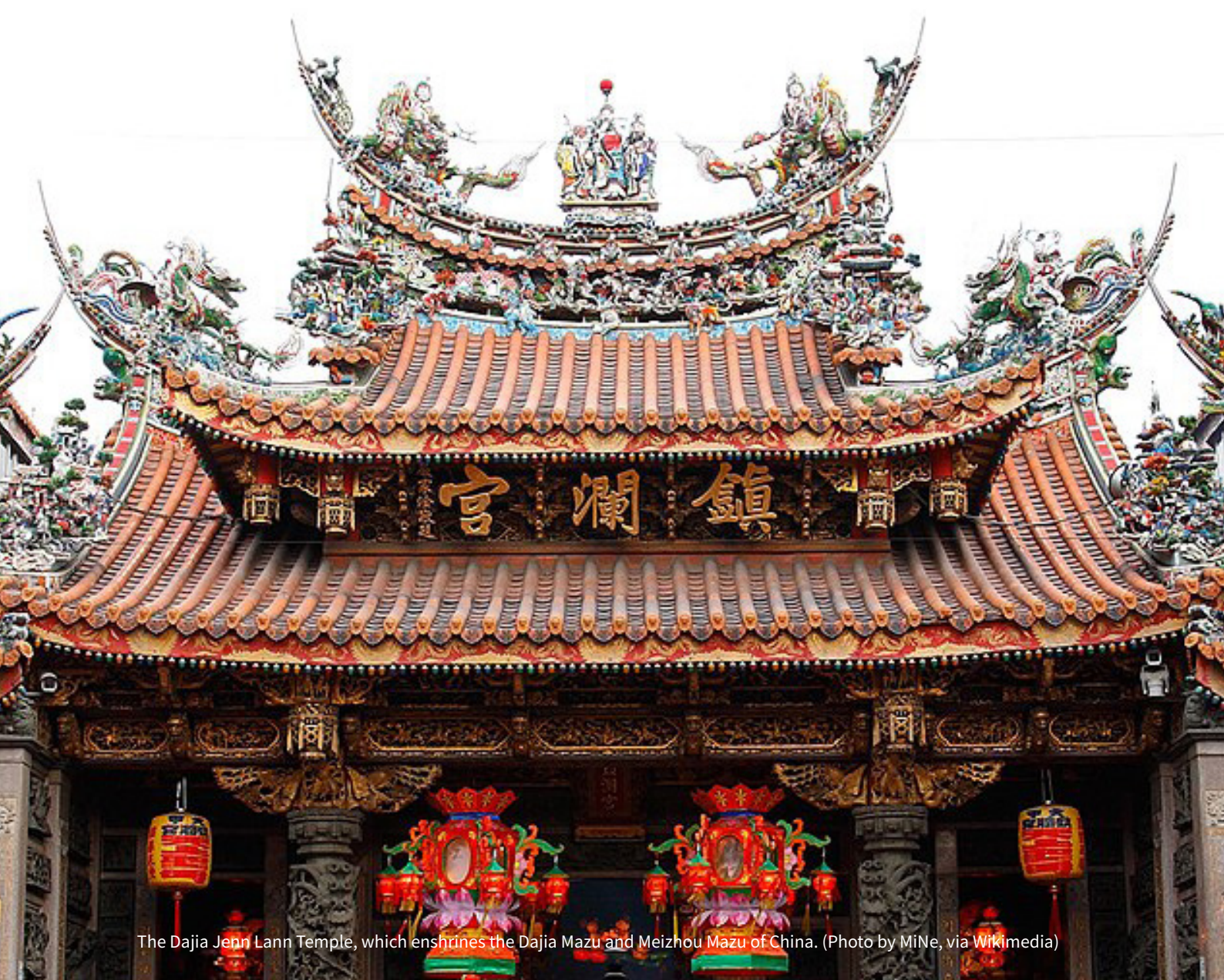
The Dajia Jenn Lann Temple, which enshrines the Dajia Mazu and Meizhou Mazu of China.