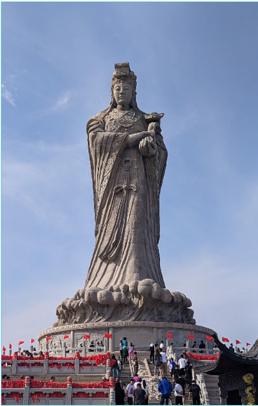
The Mazu Cultural Park in Tianjin, which opened in 2016.