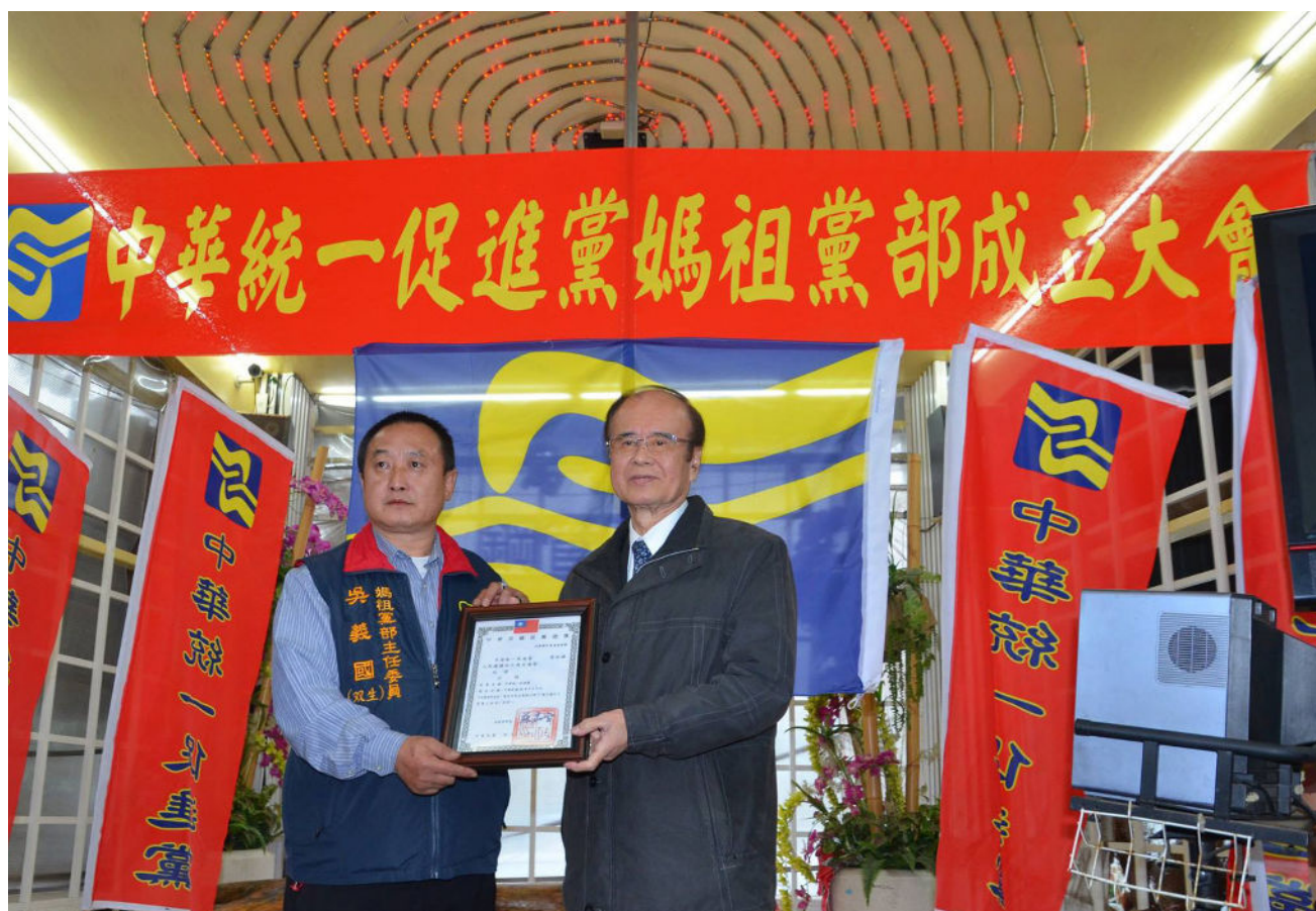
The Chinese Unification Promotion Party (CUPP) established the Mazu Party Department in 2016