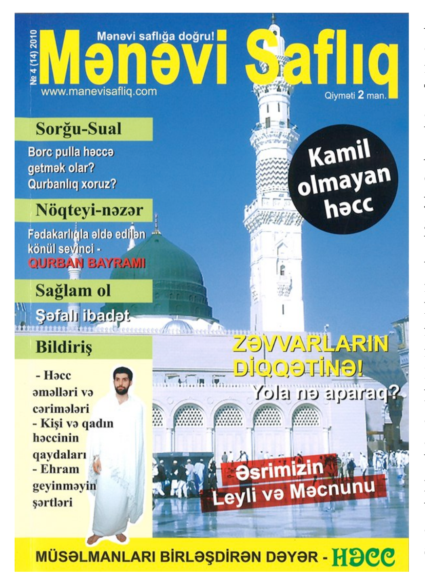
Cover of the Mənəvi Saflıq magazine, its namesake association's main publication (MSDIB).

Azerbaijani businesses and entrepreneurs both in-country and abroad. The commercial advertisements that have been published in the Mənəvi Saflıq magazine over the last couple of years, for instance, offer a glimpse of the kind of businesses that support the association. They include a large hotel, a kebab snack bar, a furniture shop and interior decorator, and Islamic beauty parlour, a large real estate agency and an advertising agency, a computer business, and publishing house. Those who openly advertise and, as such, show their support publicly are most likely part of a larger group of businesspeople who prefer to offer more discreet support.